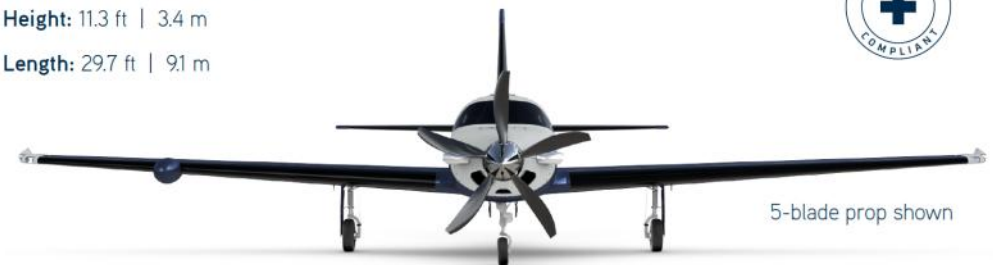
5-blade prop shown